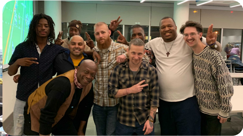
Taking a quick break from watching football for a group photo on Thanksgiving night