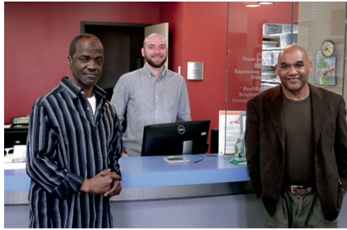
Dismas residents at their first visit with Interfaith

ismas is proud to announce a new partnership with Interfaith Dental to complement the clinical services offered to Dismas residents. Thanks to a funding partnership with the HCA Foundation, Interfaith will be providing oral hygiene examinations and treatments to Dismas residents at reduced rates. Founded in 1994, Interfaith provides affordable dental care for low-income, uninsured working families and seniors. Interfaith has grown to serve residents in ten Middle Tennessee counties through two clinic sites and nearly 200 volunteers. Emergency dental services for those needing relief from pain and complete dental services are also available. Because oral hygiene is essential for the overall health of the body, Interfaith's goal is to eliminate dental disease with individualized treatment and give patients the education and skills they need for proper oral health.